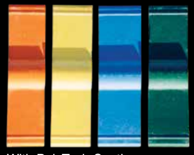
With PolyTech Coating