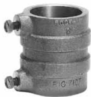
FIG. 7107 - Coupling (Sock-It® x Sock-It®)

GASKETS: EPDM, as specified in accordance with ASTM D 2000