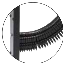
Non-Jamming Extraction of Staples