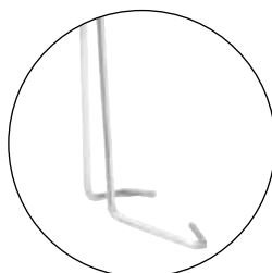
Retractable wire-form stand