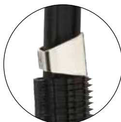
Slide Weight for easy feeding

Easily secures 3/8, 1/2, & 5/8 in. (9.5, 12.7 & 15.88 mm) "PEX" to 1 or 2 in. (25.4 or 50.8 mm) foamboard insulation. Weight for magazine slide ensures smooth magazine feed and uninterrupted stapling when laying out PEX. Sturdy, retractable wire-form stand allows stapler to stand upright when not in use or when reloading staples. Compatibility: Malco Foamboard Stapler and Staples (FBSN, FBSN1 & FBSN2) are compatible with most popular brands of foamboard stapling systems. Malco 1-1/2 in. (38.1 mm) staples are designed for 1 in. (25.4 mm) foamboard. Additional Barbs on 2 1/2 in. (63.5 mm) Staple "Double the Holding Strength" in 2 in. (50.8 mm) foamboard.