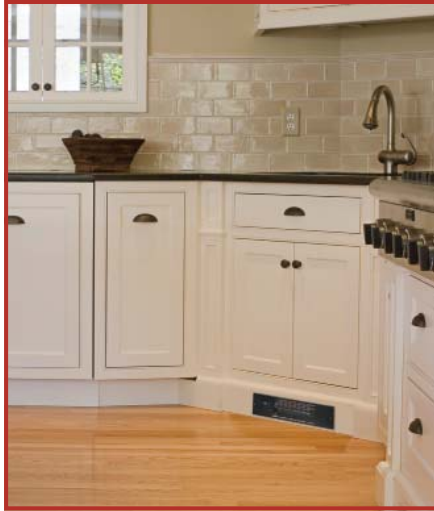
Install Hide-A-Vector3 beneath a kitchen cabinet.