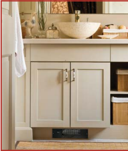
Install Hide-A-Vector3 under a bathroom vanity.