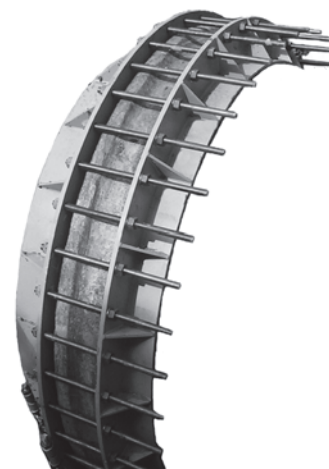
JCM 143 - 14" - 72" Larger sizes available

JCM 143 Bell Joint Leak Clamp 14" and Larger - Fabricated Steel