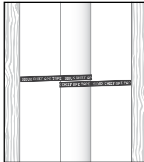
Typical stud cavity installation