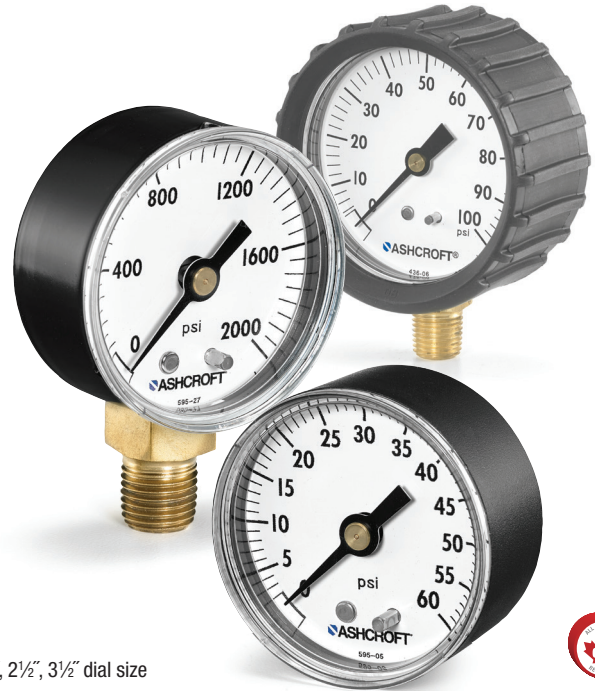
1005 1½", 2", 2½", 3½" dial size