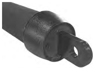
Pulling Bell Assembly

Flex-Ring® joint pipe with its positive, flexible joint restraint may also be used in trenchless applications such as horizontal directional drilling and pipe bursting. With spigot ahead, the low-profile Flex-Ring® bell assembles quickly and offers a smooth transition during pipe pull-back. AMERICAN offers a Flex-Ring® pulling bell assembly specifically designed for this installation method.