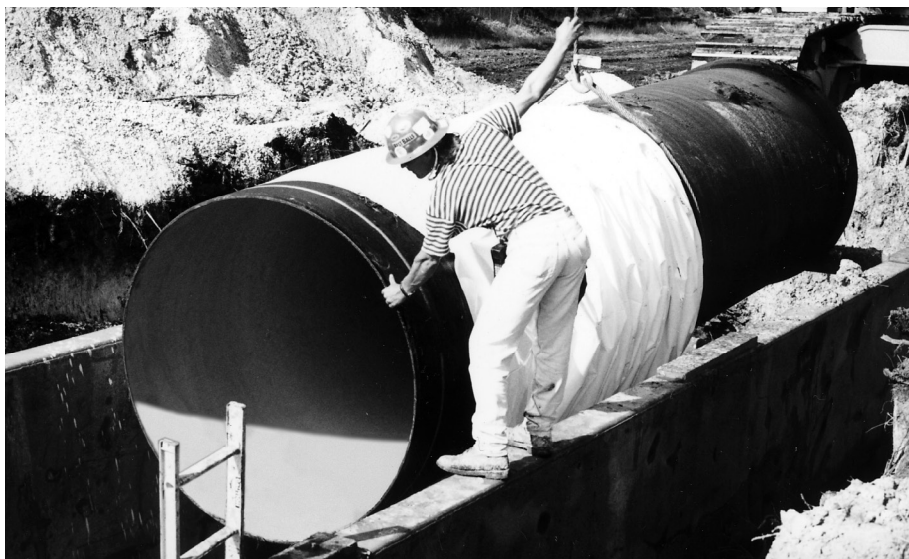
This 64" Ductile Iron Fastite Joint water transmission main was furnished with standard cement lining for continuing high flow performance.

Weights are based on the minimum lining thicknesses for minimum pressure classes of Fastite ductile iron pipe. Actual lengths and weights may differ from above. Linings may taper at the ends. AMERICAN recommends the use of standard thickness cement lining per AWWA C104 for all normal installations.