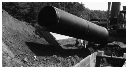
This 30" AMERICAN Ductile Iron Fastite joint treated-water transmission main was furnished and installed—as is most ductile iron pipe—with standard asphaltic coating approximately one mil thick on the outside.

This is a high-solids, chemical- and corrosion-resistant coating for protection against abrasion, moisture, corrosive fumes, chemical attack and immersion.