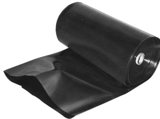
Tubing in Roll