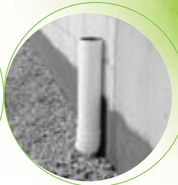
Downspout and Foundation Drainage

ADS Service: ADS representatives are committed to providing you with the answers to all your questions, including specifications, and installation and more.