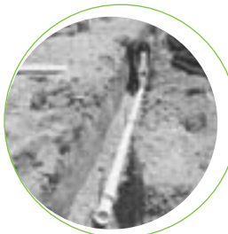
On-Site Waste Management