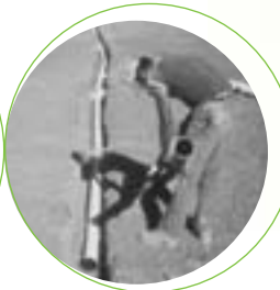
Golf Courses and Area Drainage