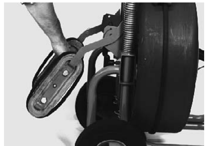
Figure 3 – Raising Stair Climbers

Raise the stair climber to the upper position by pulling out the locking pin and lifting the stair climber by the cross member until the pin locks into the upper position (Figure 3). Insert handle through the motor table rail supports and through the two holes on rear support (Figure 4). Insert the two hairpin cotter fasteners through the holes in the bottom of the handle (Figure 5). Adjust handle to desired height. Securely tighten the two T-shaped mounting knobs on rear support. Lower the stair climber.