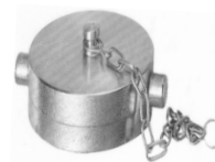
Figure No. 5709-5713