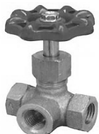
Figure No. 5662

Standard Equipment: 1/4" valve NPT Bronze three way globe valve with handwheel. Female inlets. 175 PSI.