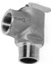
Figure No. 5660

For use on all closed systems to prevent damage in the event of a malfunction due to some foreign object or matter becoming lodged in an automatic regulating or control valve. Featuring a pop-type relief action for maximum performance.