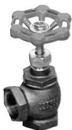
Figure No. 5663-5670

Standard Equipment: Bronze with teflon seat. 125 WSP.