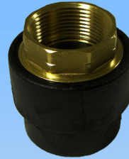
Fusion x Brass Female Adapter