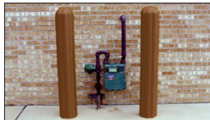
Model 1730BR 6" (15.2 cm.) (Brown) Bollard Post Sleeve

The Original HDPE Bumper Post Sleeves have a vertical fluted design to provide extra protection and easier installation. They come 56 in. (142.24 cm.) in length (to fit 4 in./10.2 cm., 6 in./15.2 cm. and 8 in./20.3 cm. pipe) and are available in yellow, red, blue, white, green, orange, lime, brown and black. The 72 in. (182.9 cm.) length Bumper Post Sleeves (to fit 6 in./15.2 cm. and 8 in./20.3 cm. pipe) are available in yellow only. Sleeve height may be easily trimmed for an exact fit.