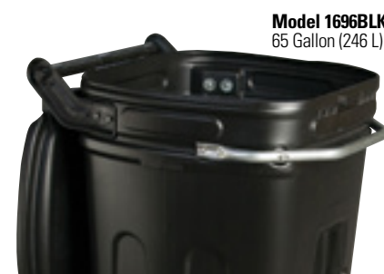
Model 1696BLK 65 Gallon (246 L)