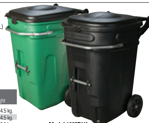
Model 1697BLK 95 Gallon (359.6 L)