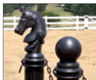
Hitching Post Classic Post

Beautiful HDPE post sleeves slip over 4 in. (10.2 cm.) x 4 in. (10.2 cm.) wooden or steel posts or can be used free standing with optional rubber base. Available in three styles. Includes 6 ft. (182.9 cm.) of poly chain.