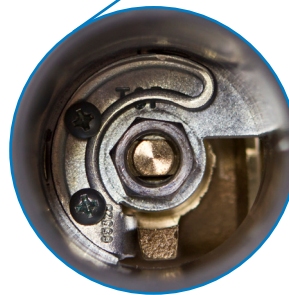
Memory stop enables system balancing