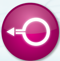
BOOSTING FROM WATER MAIN