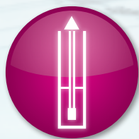
WATER SUPPLY FROM A WELL

The GRUNDFOS MQ is ideal for indoor applications. For outdoor installations, a protection cover is now available.