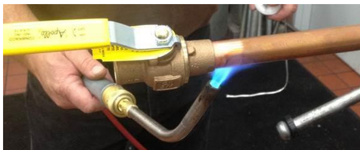
Figure 1 - Preheat tubing

Refer to ASTM B828 "Standard Practice for Making Capillary Joints by Soldering of Copper Tube and Fittings" . Preheat for soldering by concentrating the heat on the tube first, then the valve solder cup, always directing the heat away from body joint. See figure 1. The extent of this preheating depends on the size of tube. After preheating direct the heat on the valve cup area (avoiding the body joint) to aid capillary action in drawing the molten filler metal into the cup. See figure 2.