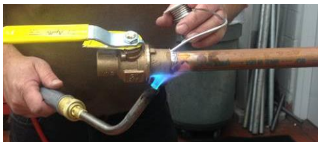
Figure 2 – Heat valve cup area and apply solder