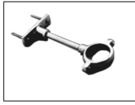
T46—Split ring wall support for flush connection