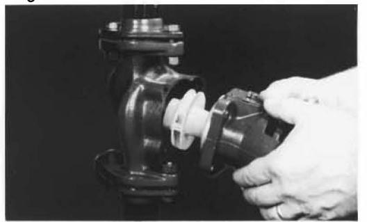
Pull the Bearing Assembly from the Pump Body.