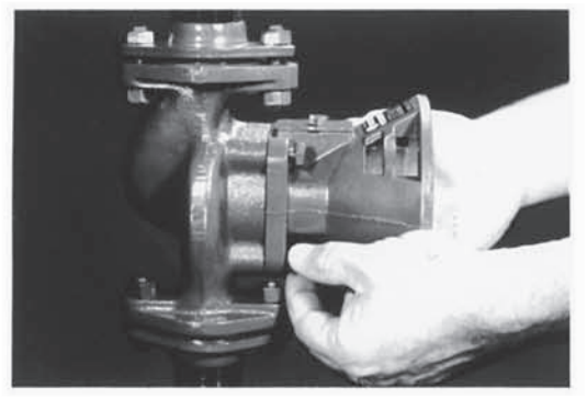
Fit the Bearing Assembly into the Pump Body and tighten Cap Screws evenly. Do not over tighten.