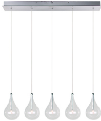
E23115-18 Larmes 5-Light Pendant