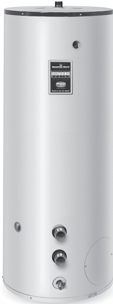
Photo is of M-3-ST80R5