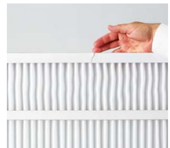
DuraFlex® media has "memory" which allows PerfectPleat® filters to remain functional, even when the frame has been compromised.