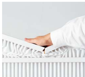
As a result of its unique design, the PerfectPleat® filter can withstand significant damage.

With the superior resiliency of DuraFlex media and no need for wire support, the PerfectPleat filter can sustain significant abuse and maintain its shape and pleat spacing. The absence of the wire also makes the filter totally incinerable, which simplifies disposal. The PerfectPleat filter meets or exceeds all current expectations for service life.