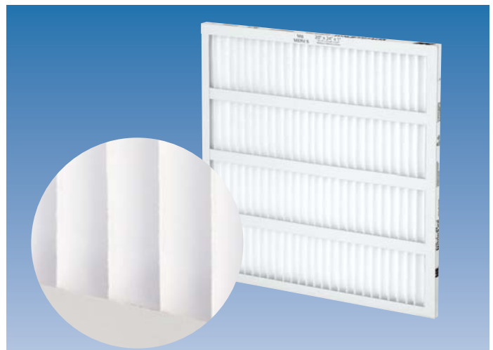
PerfectPleat® HC M8 filter, 1" thick, air leaving side. A blue stripe designates PerfectPleat® HC M8 filter media.

The 1" PerfectPleat HC M8 and PerfectPleat filters have the same durability and performance as the 2" models. Both are made using DuraFlex media encased in a 28 pt. beverage carrier board frame. PerfectPleat 1" filter models feature a perimeter frame, with three supporting straps on the air entering and air leaving sides of the filter. Both models resist crushing and abuse and can be used in any application where 1" filters are currently in place. The PerfectPleat HC M8 and PerfectPleat filters rate MERV 8 and MERV 7 respectively.