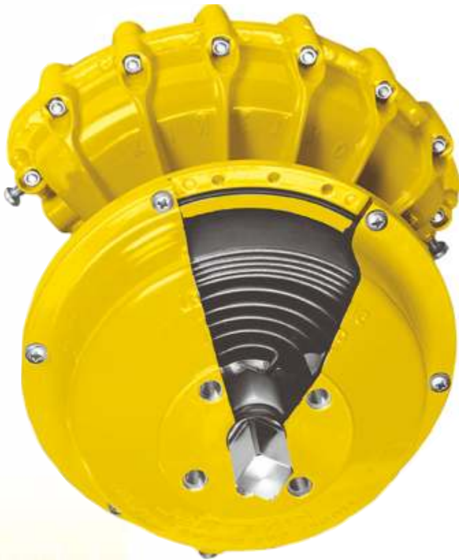
Spring housing cut away