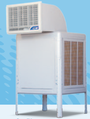
CoolView Ground Mount Window Cooler (Models: GMA 30/50 & GMR 30/50)