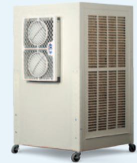
CoolTool - CTV2 Multi-use Evaporative Cooler