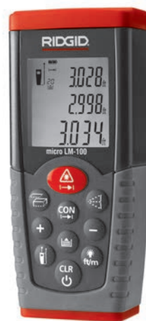
micro LM-100 Laser Distance Meter