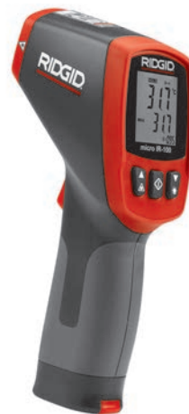
micro IR-100 Non-Contact Infrared Thermometer