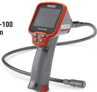
micro CA-100 Inspection Camera