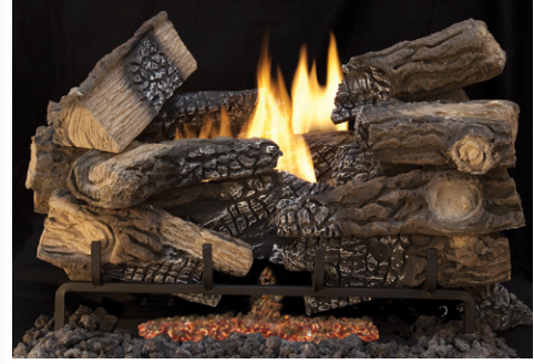
Massive Mixed Oak

The Tri-Flame Series brings a remarkable new technology to the field of vent-free gas logs. To duplicate the look of a real wood fire, these models include a glowing, coal bed at its base. The bright, glowing coals and flickering embers are achieved through the use of two unique technologies. The Tri-Flame burner offers the unusual feature of an additional row of flames behind the logs. The result is a distinctive appearance with a very deep flame pattern.