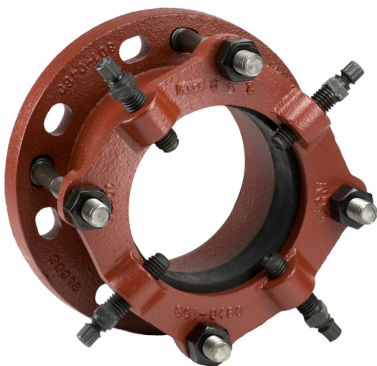
JCM 301 Restrained Flanged Coupling Adapter

Restraining set screws are not recommended for use on Asbestos Cement, PVC, HDPE, Fiberglass and other breakable or yielding types of piping materials.