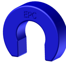
Figure 2 TECTITE Removal Tool