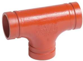
No. 20 Tee