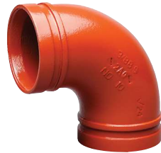
No. 10 Elbow