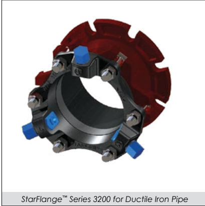
StarFlange™ Series 3200 for Ductile Iron Pipe

Restrained Adapter Flange Coupling for Ductile Iron Pipe