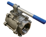
4" Includes Locking Handle