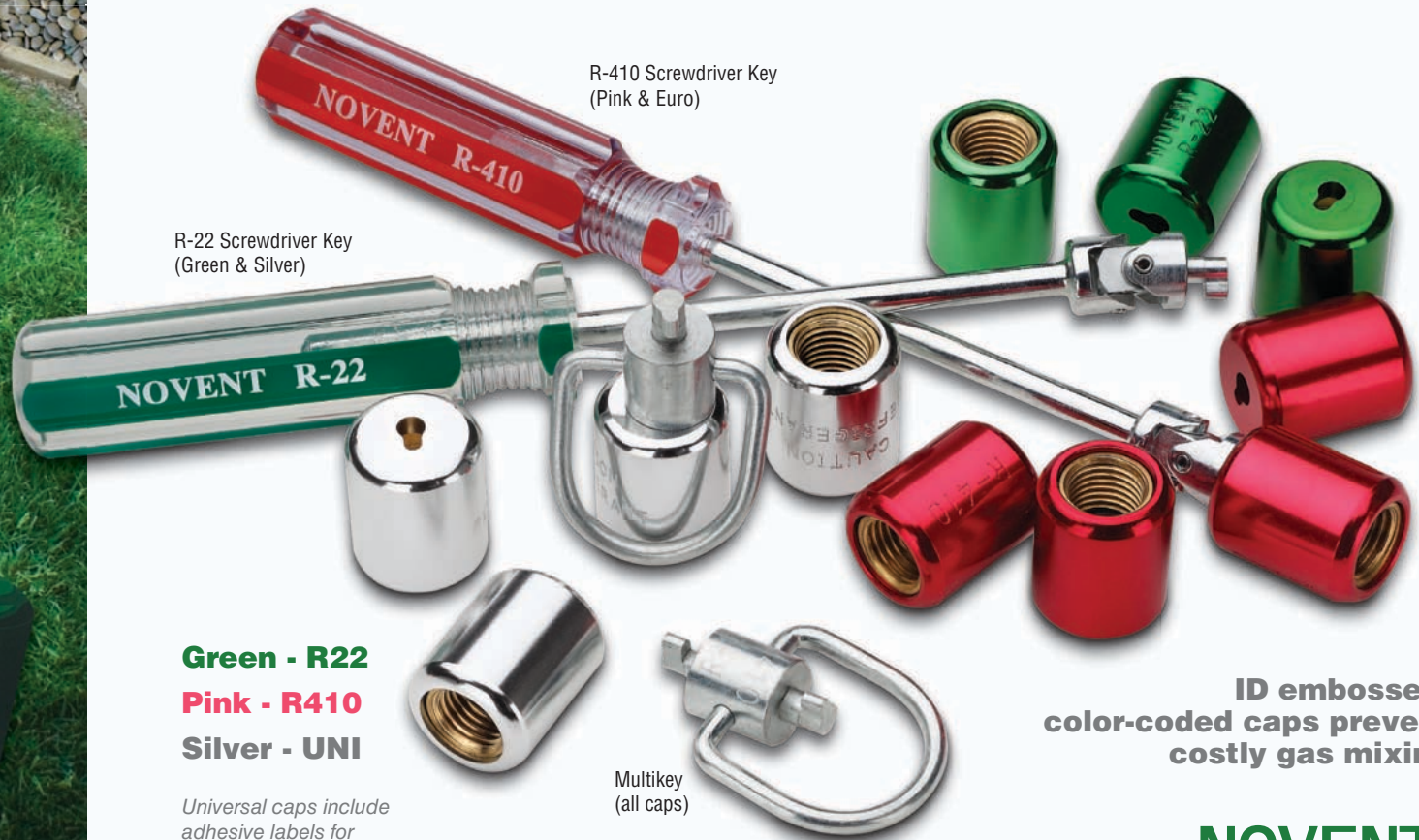
R-410 Screwdriver Key (Pink & Euro)