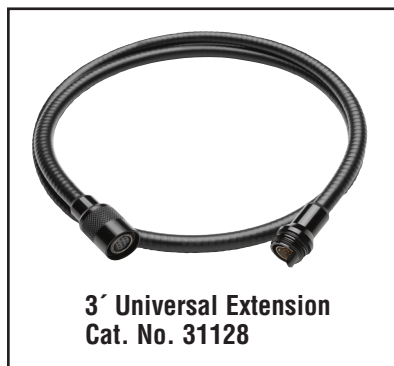
3' Universal Extension Cat. No. 31128