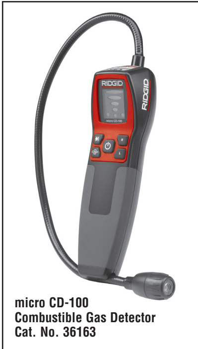
micro CD-100 Combustible Gas Detector Cat. No. 36163