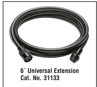
6' Universal Extension Cat. No. 31133