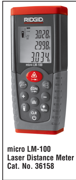
micro LM-100 Laser Distance Meter Cat. No. 36158