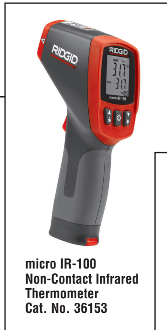
micro IR-100 Non-Contact Infrared Thermometer Cat. No. 36153