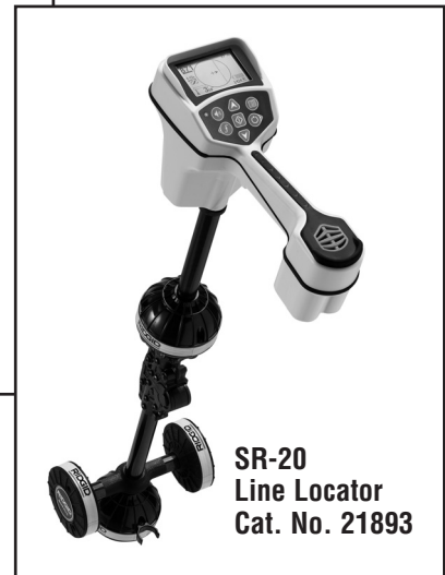
SR-20 Line Locator Cat. No. 21893