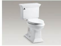
Two-piece elongated 1.6 gpf chair height toilet K-3819-0