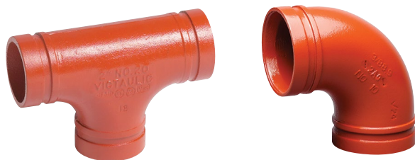
No. 20 Tee