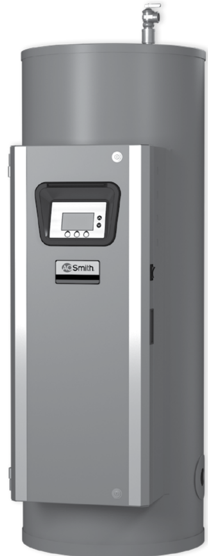
DSE-5A thru DSE-120A (DSE-100A Shown)

Attention: Changes have been made to some models. Please note that this spec sheet refers specifically to models manufactured in McBee, SC