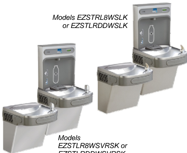
Models EZSTLR8WSLK or EZSTLRDDWSLK

**Based on 80°F inlet water & 90°F ambient air temp for 50°F chilled drinking water.