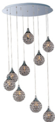
E24020-20PC Brilliant 9-Light Pendant