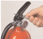
Break Seal and Pull Out the Safety Pin

This unit will not operate when it is on the mounting device. The extinguisher must be removed from the mounting device or it cannot discharge its contents to fight a fire.