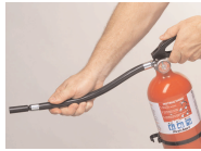
Aim Nozzle at Base of Fire