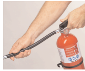
Press Lever To Discharge Powder