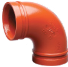
No. 10 Elbow