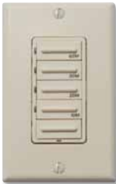
FV-WCD01-W (white) FV-WCD01-A (almond)

— Ideal for Panasonic's quiet fans to ensure you don't forget to shut them off