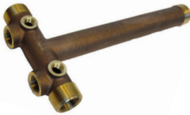
NO LEAD BRASS and BRONZE Long Cast Tank Crosses with 2 drain & 2 top ports.