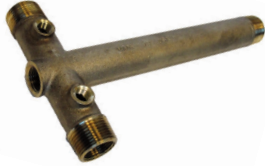
NO LEAD BRASS and BRONZE Long Cast Tank Crosses with 1 drain & 2 top ports.