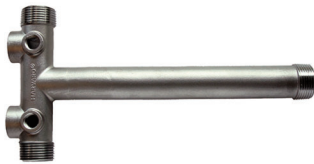
304 STAINLESS STEEL Long Cast Tank Crosses with 2 drain & 2 top ports.