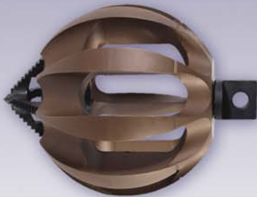
Cat # 4CG 4" ClogChopper