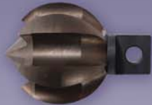
Cat # 2CG 2" ClogChopper