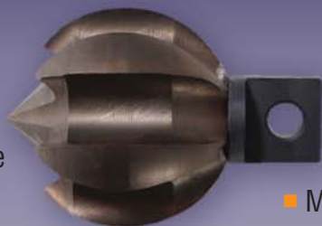
Cat # 2CG 2" ClogChopper

General offers a variety of sizes, and connector options, including for our drum type cables and sectional G connectors, as well as for Ridgid® and Electric Eel® connectors.