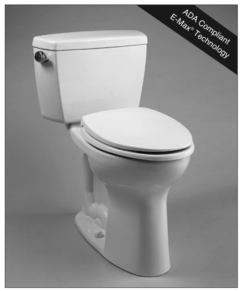
CST744EL - Eco Drake® Close Coupled Toilet with SS114 - SoftClose Seat