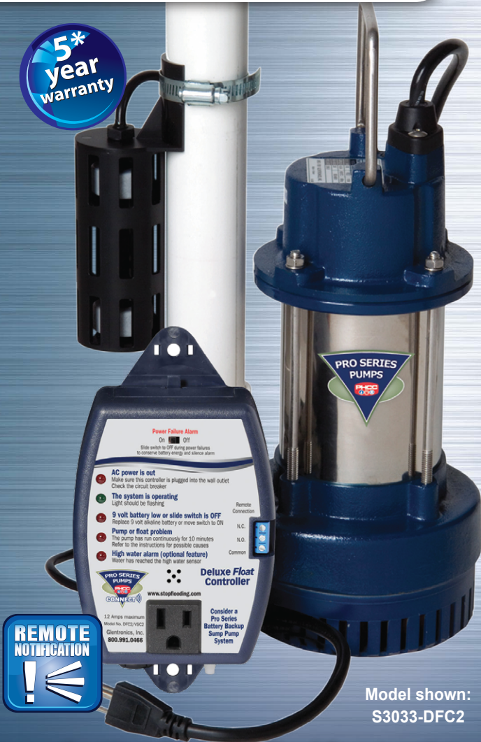
Model shown: S3033-DFC2