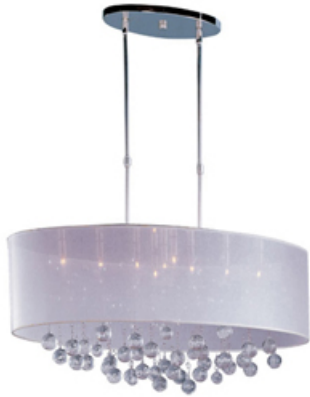
E22387-120PC Veil 9-Light Pendant