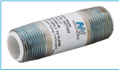
Thread X Thread