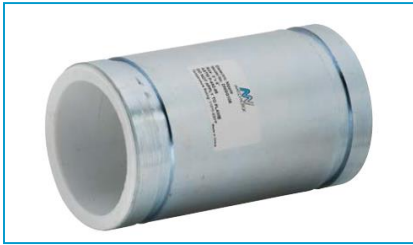
Groove X Groove