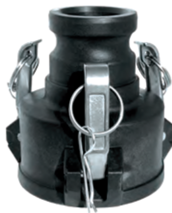
300 B-200 A