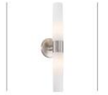
Mounted Horizontally or Vertically

Image File Name: P5042-144-- 1377187721.jpg