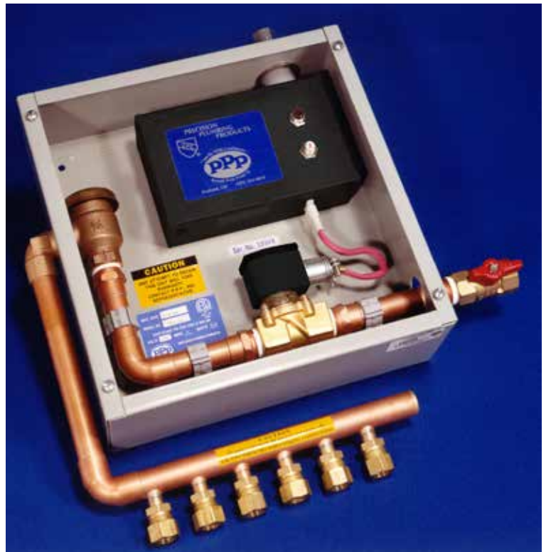
SURFACE MOUNT CABINET

The PRIME-TIME PRIMING ASSEMBLY will supply a minimum of 2 oz. of potable water at 20 P.S.I.G. at a preset factory setting of 10 seconds every 24 hours. The entire unit is pre-assembled in a steel cabinet ready to be either surface or flush wall mounted. The Priming assembly must be mounted above the finished floor.