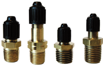
SN18NL, SN18LNL, SN25NL, SN25LNL